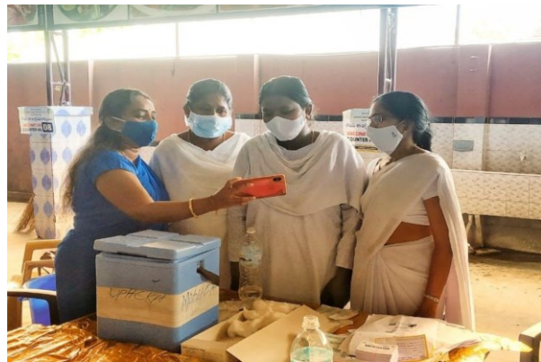
Left: Poster on Debunking Vaccine Myths Right: Dissemination of posters