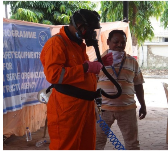
Demonstration of the use of PPE and safety equipment for confined entry space