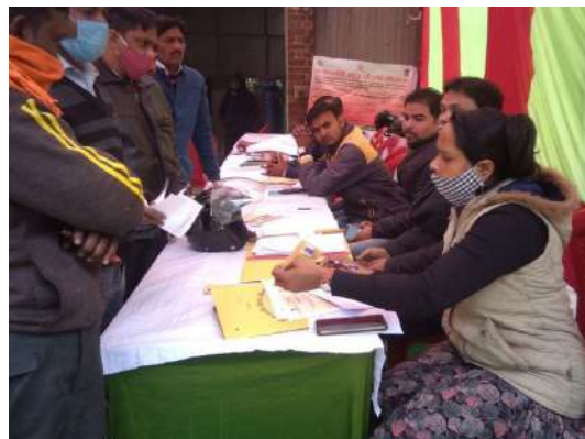
City Level Camps for Svanidhi se Samridhhi