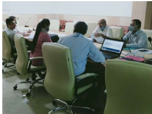
Giving ULB official in-person analysis of reports.