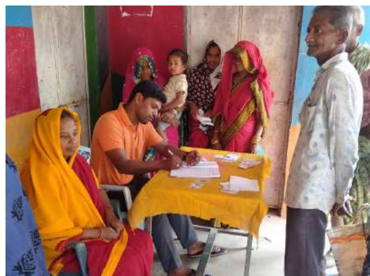
Left: Door-to-Door enumeration of migrant workers Right: Enumeration at the CSC camp