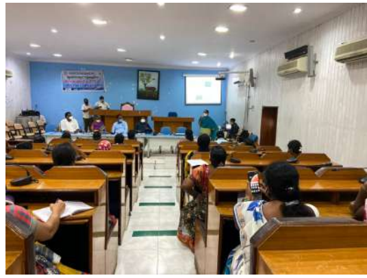
Training of Community Resource Persons on the implementation strategy.