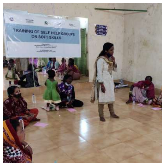
Left: Training Manual cover page Right: Training SHGs on soft skills