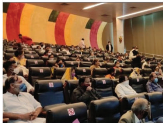
Inauguration of Migrant cell and formal contract sharing between Surat Municipal Corporation (SMC) and Urban Management Centre (UMC)