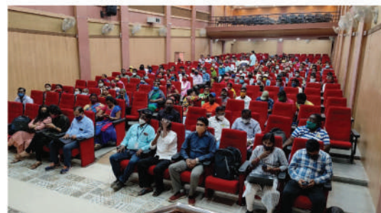
Sanitation workers of Berhampur attending a training on use of PPEs