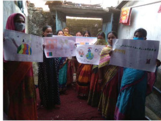
Left: Mass cleaning done by MISAAL committee in Sambalpur Right: MISAAL committee members in Sambalpur developed their own messages through paintings to spread awareness in their own settlement