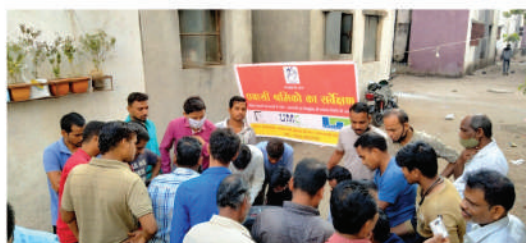
Orientation of migrant workers in Kosad Awas, Amroli in Surat