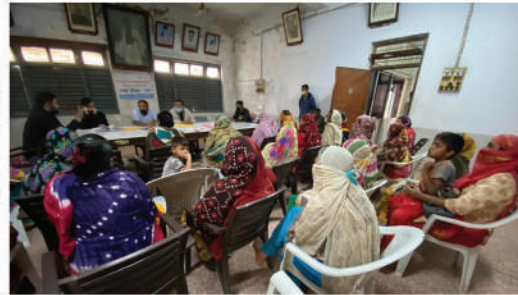
Left: Members of MISAAL committees from ward no.13 met ward officers to discuss their SIP and presented a painting made by them to the ward officer to establish a collaborative partnership Right: MISAAL committee members from Kumbharwada in Porbandar met the chief officer to discuss their concerns and SIP