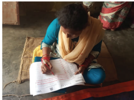
Left: MISAAL committee putting up their plan in the settlements Right: Filling their Bindi Charts.