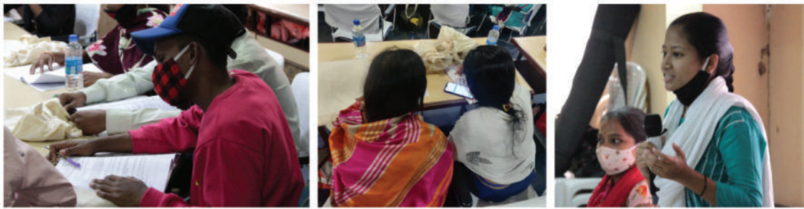
Enumerators participating in a mock-up of the survey