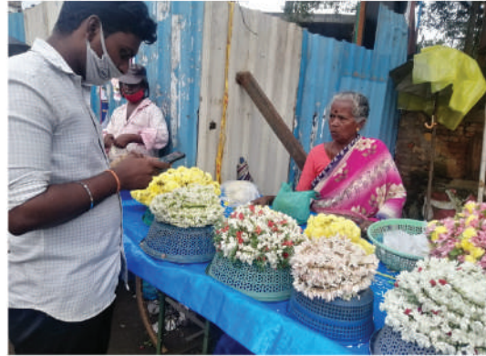
ULB functionaries collecting data from street vendors for socio economic profiling