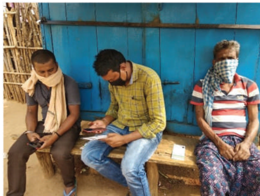
Left: Enumeration of families of migrant workers in Mohuda panchayat of Kukudakhandi block Right: Enumeration of individual migrant worker in Mohuda panchayat of Kukudakhandi block