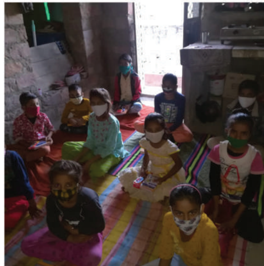
Learning with fun initiative in Sambalpur, Jodhpur and Porbandar. Children can be seen attending learning sessions.