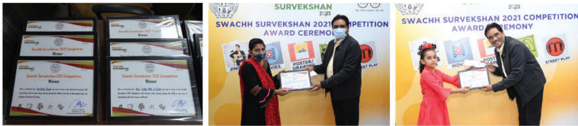
AMC felicitating MISAAL Settlement Committees (MSC) members and MISAAL Fellows

Ahmedabad Municipal Corporation (AMC) organized wall painting competitions and awareness activities to sensitize communities towards sanitation and hygiene. MISAAL Settlement Committees (MSC), IEC Mandal and MISAAL Fellows participated in these activities along with other volunteers. About 70 participants and 24 teams participated in the wall painting competition in December 2020. AMC awarded three community members for creating a short film and in theatre. UMC has supported and will continue to support AMC in strengthening their connection with their community which resulted in MSC members and other residents of the settlements being happy to be recognized and it has motivated them to actively participate in the future.