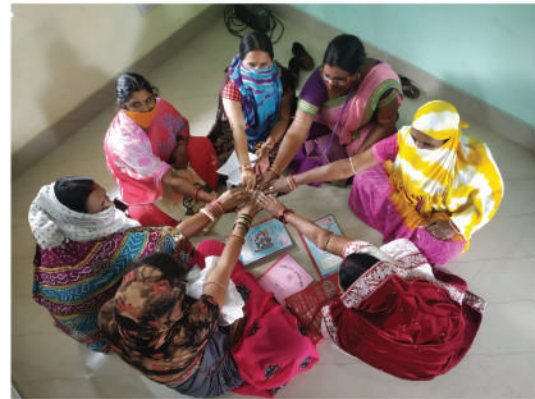
Left:ULB officials orienting ALF members on the training program Right: ALF members promising regular book keeping