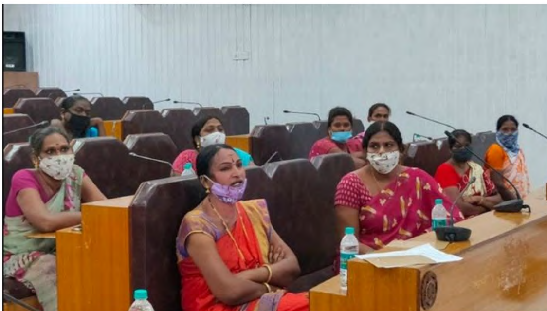
Training workshop for transgender group on O&M of community toilet and maintaining records.

Under the DAY-NULM and the SBM convergence program, ten transgender women's self-help groups have been formed in Warangal. UMC in collaboration with GWMC and MEPMA Telangana has been helping them explore avenues to earn a sustainable livelihood. After one of the newly formed groups expressed an interest in sanitation work, UMC worked with various organizations to educate them on the scope of work in the field.