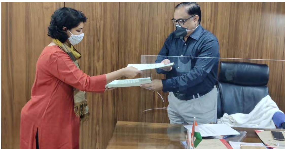
UMC signing MOU with Deputy Municipal Commissioner, Surat Municipal Corporation.

The Urban Management Centre (UMC) and the Surat Municipal Corporation signed an MOU on 5 th November 2020 to kick start the Empowering Migrants for Building Resilience through Comprehensive Entitlements (EMBRACE) program in Surat. We are also working closely with and benefitting from the unrelenting support of the Government of Odisha and Ganjam District Administration.