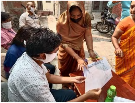
Left: MISAAL committee members discussing daily service monitoring 'Bindi' Chart with ULB officials in Jodhpur.