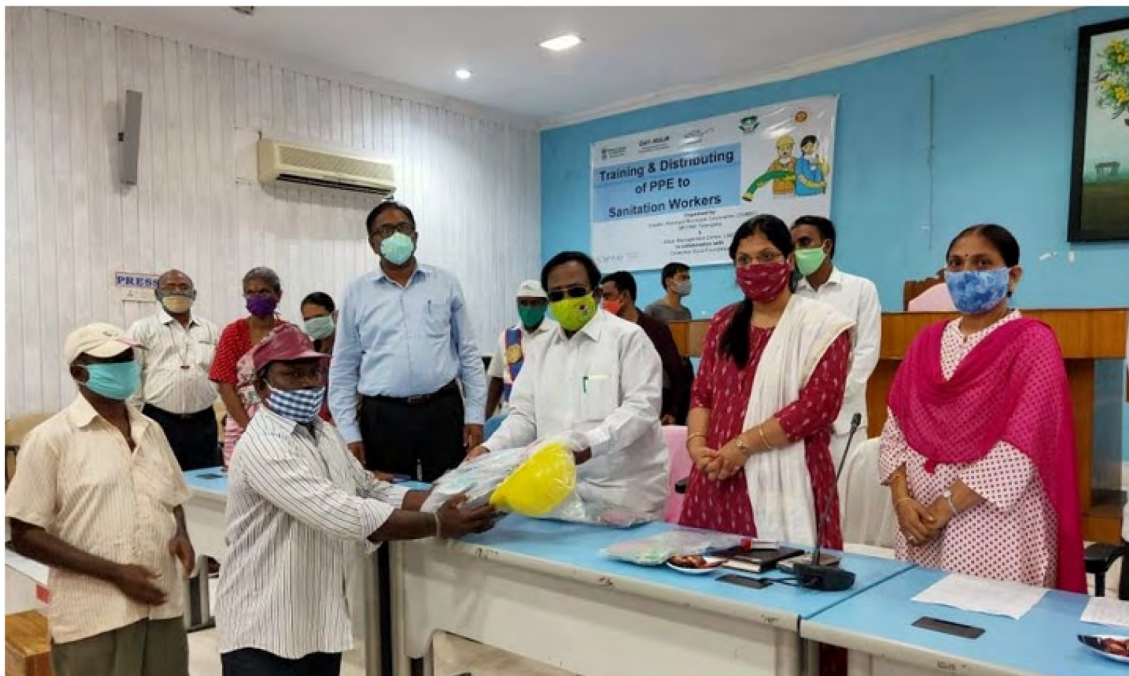
Distribution of PPE kits to sanitation workers by Hon. Mayor and Commissioner, GWMC.

The UMC team led the distribution of PPE kits in Warangal to 400 sanitation workers in Warangal. This has been especially important amid the ongoing COVID-19 crisis. This was made possible by CSR support from SAMHITA and whole-hearted support of the Greater Warangal Municipal Corporation (GWMC). The PPE kits included masks, gloves, aprons, gumboots, helmet, soap, and sanitizer. With the support of GWMC's health and sanitation teams, ward wise data of all the contractual sanitation workers was collected. UMC ensured that the PPE kits were made available based on specific sizes as required