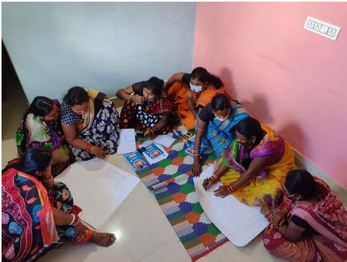
Financial literacy training program for SHGs.

Now that SHGs have begun to run their own enterprises, the next step was to support them to make smart financial decisions to improve their business efficiency and maximize their profits. This workshop which was organized with the support of the Sambalpur Municipal Corporation is the beginning of several such workshops where we work.