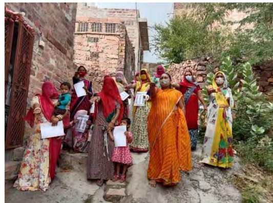
Right: MISAAL committee members taking swachhata oath on Global Handwashing Day in Jodhpur.