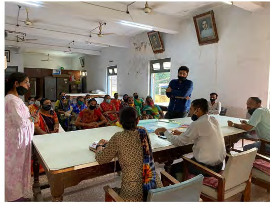
Right: MISAAL committee members discussing settlement improvement plans with ULB officials in Porbandar.

MISAAL committee members presented the issues in their settlements related to water, sanitation, and cleanliness to their respective ward officers in Sambhalpur, Porbandar, and Jodhpur. These meetings are a step towards collaborative solutioning to these persistent issues and range from infrastructure improvements to improved operations.