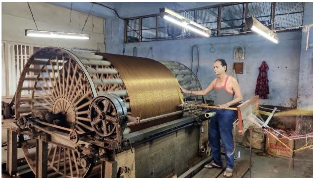
A worker engaged in thread making in one of the power loom units in Surat.

UMC's approach is to work on the enumeration of migrant workers and their families both at the source and the destination and to support systems that help them gain access to social, health, and financial safety schemes. In addition to this, the organizations will also link workers and employers via job portals to ease seeking of employment.