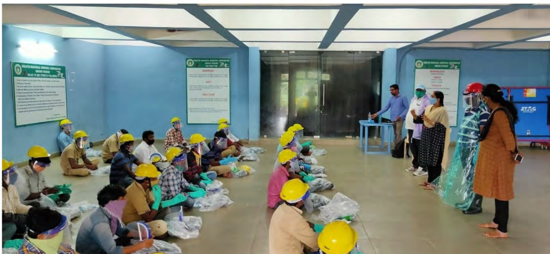
Distribution and Training workshop for Sanitation workers on the usage of PPE organized by UMC with support from GWMC and MEPMA - TS.

for the workers. The training was also provided so that the workers could learn how to use the PPE kits correctly. The whole process was spread across six days to enable social distancing. Each day, a batch of 50 sanitation workers were given their PPE kit and given training for its usage. After 15 days, the team also collected feedback from the workers on the usage of PPE kits.