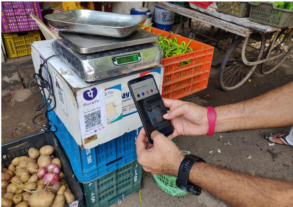
A customer using digital payment at a street vendor.