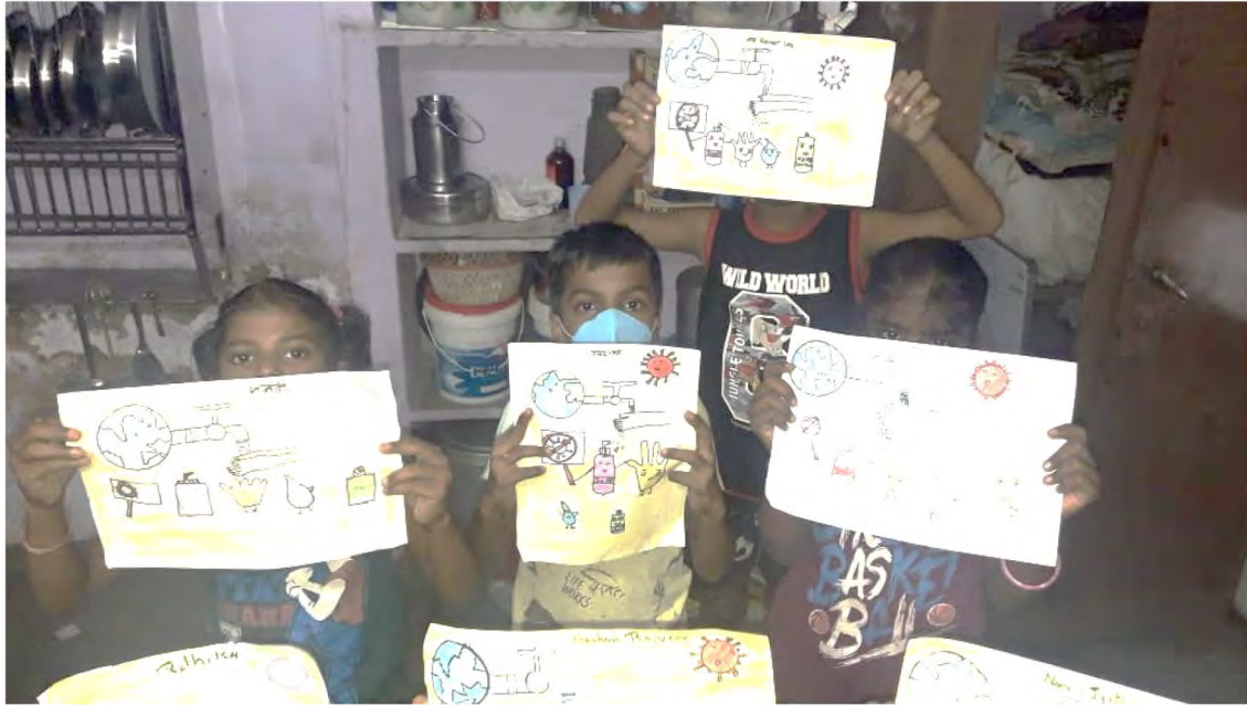
Children engaged in 'Gyan thi Gammat' - learning through fun initiative under MISAAL showcasing awareness posters made for Global Handwashing Day.

On the occasion of the Global Handwashing Day on 15th October 2020, the MISAAL committees, MISAAL Fellows, SHGs and the children engaged under the program came together to highlight the importance of handwashing among their peers and communities. To reinforce the message among children, they also conducted arts and crafts activities.