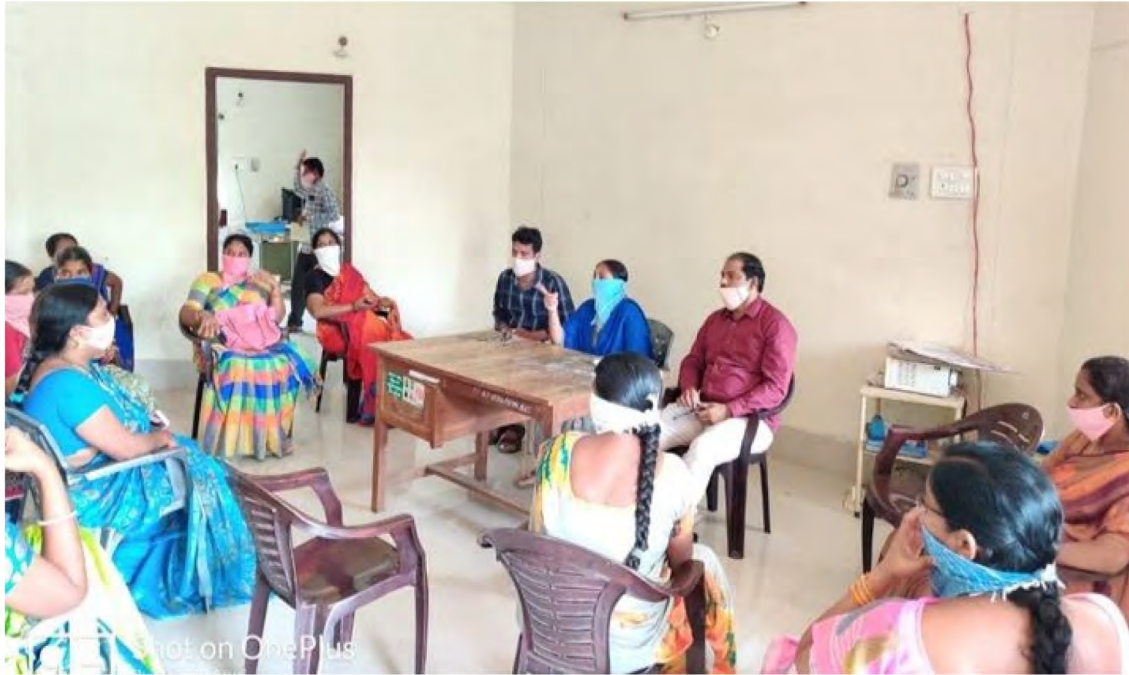
Training SHGs in pre-bid meeting on filling tender for O&M of community toilet.

A training was organized on 16th July 2020 with ASCI and MEPMA to explain the standard operating procedures related to the maintenance of Community Toilets. In the training session, 14 trainees learned about record keeping, special safety and hygiene measures during the COVID-19 crisis, and other important responsibilities.