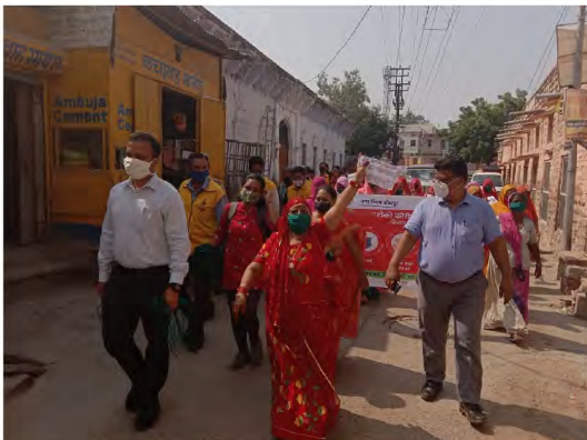
Left: MISAAL committee members participating in "Toko, Corona Roko" campaign rally with Municipal Commissioner of Nagar Nigam Jodhpur.

The MISAAL Committee members led this awareness drive to tell people about the importance of wearing masks to counter the spread of COVID-19. As a part of the drive, they also listed out other safety measures that the people in the settlements of Jodhpur could adopt.