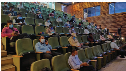
Training of ULBs on the adoption of Sanitation Mapping Tool in Ahmedabad