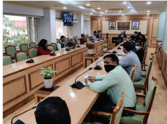
Launch of Socio-Economic profiling of PMSVANidhi programme