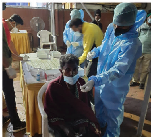
Migrant workers getting tested for COVID-19 on arrival at Surat Railway Station