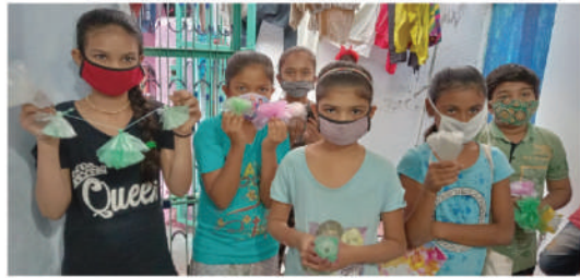
MISAAL fellows conducting creative activities for kids