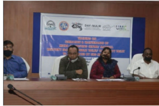
Training sessions with ULB functionaries