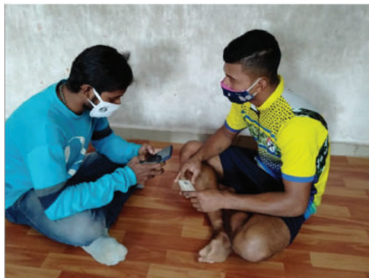
Enumeration of Migrant Workers in Surat