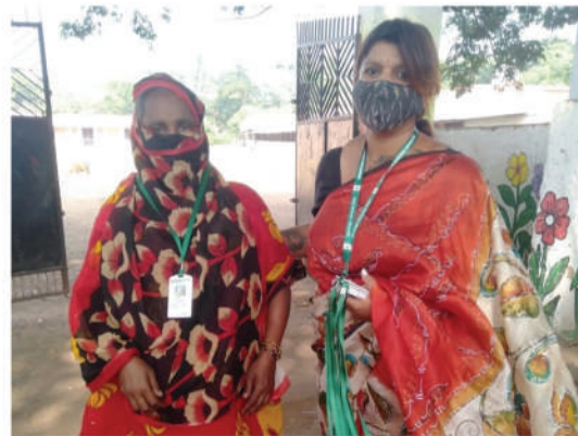
Left: ID Cards issued by BMC to waste pickers Right: UMC team member handing over ID cards