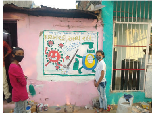
Kids proudly posing with their creatives in MISAAL settlements, Ahmedabad