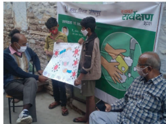
Left: Kids posing with their posters in MISAAL settlements in Jodhpur Right: JNN Officials appreciating the posters made by settlement kids