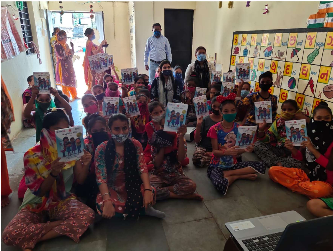
Figure 6 : Distributing Menstrupedia to all the participants of the awareness campaign.