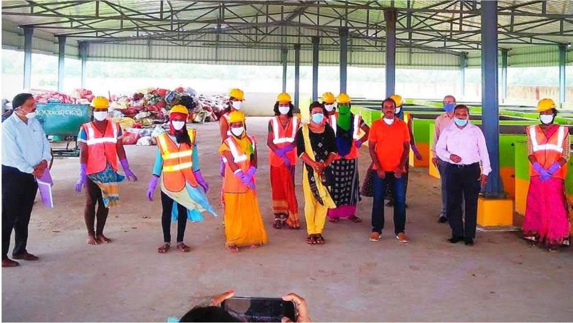
Figure 4: The SHG members at the micro composting centre