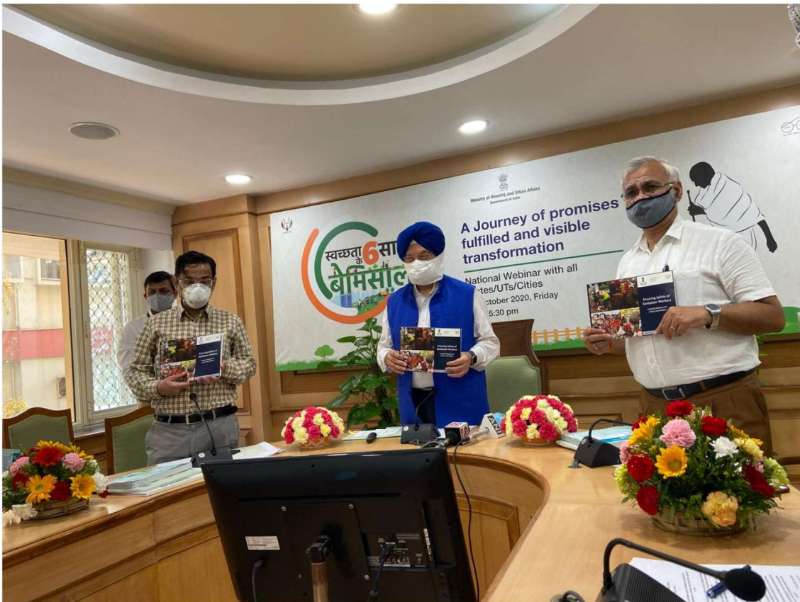
Figure 5: Mr. Hardeep Singh Puri, the Union Minister, MoHUA, GOI launching the Sanitation Mapping Tool on October 2nd, 2020

UMC is Honoured to Provide Technical Support to Swachh Bharat Mission (Urban)