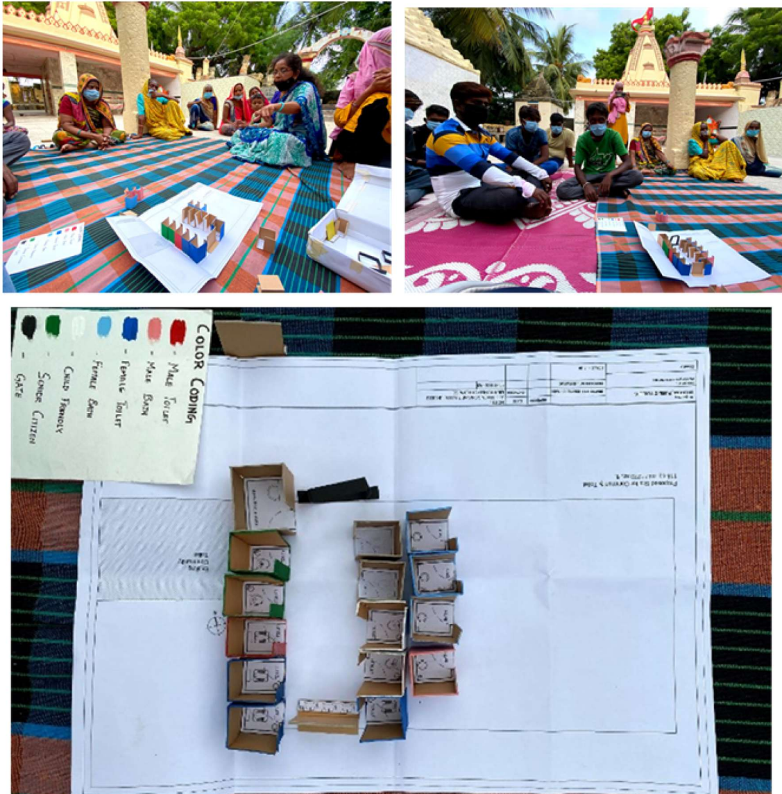
Figure 8-10: Participatory exercise to design public toilets in Jodhpur and Porbandar

The intent towards a participatory approach towards designing their community toilet was to listen to the voice of the community for whom the toilets are being designed. Since they are the end users of the facility, it is important to understand their views and inhibitions to using these toilets. Every community has a different outlook as well as needs for the shared sanitation services. In a business as usual scenario, these concerns are more often than not, left unvoiced.