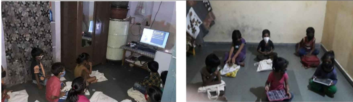
Figure 2 and 3 : Children learning sessions under the UMC initiative 'Gyan thi Gammat' in five MISAAL settlements of Ahmedabad in collaboration with PRATHAM.

In order to engage such children and anchor their interest in education, UMC initiated the 'Gyan thi Gammat (Learning with Fun)' initiative in 5 MISAAL settlements of Ahmedabad in collaboration with PRATHAM. The initiative focuses on providing aptitude-based learning for overall development of these children. The emphasis is on enhancing their basic reading, writing, speaking skills, calculation skills, general knowledge and WASH related behaviour. 'MISAAL Fellows – teaching facilitators' having interest in educating children, were identified in each settlement, trained by PRATHAM, where they have learnt activity-based teaching methods and were provided an education kit comprising of a computer and white board for visual learning aids that accelerated the grasping skills of children.