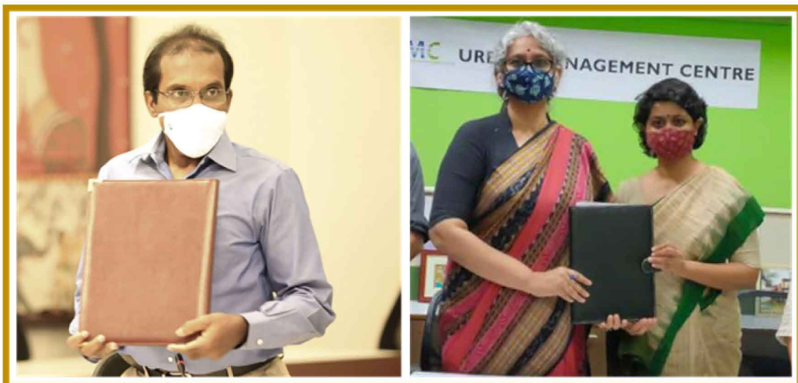
Figure 1: UMC signed MOU with Government of Odisha

UMC will provide technical assistance to establish the Garima Cell that will oversee the implementation of the scheme across all cities of the state. UMC thanks the support of Bill and Melinda Gates Foundation.