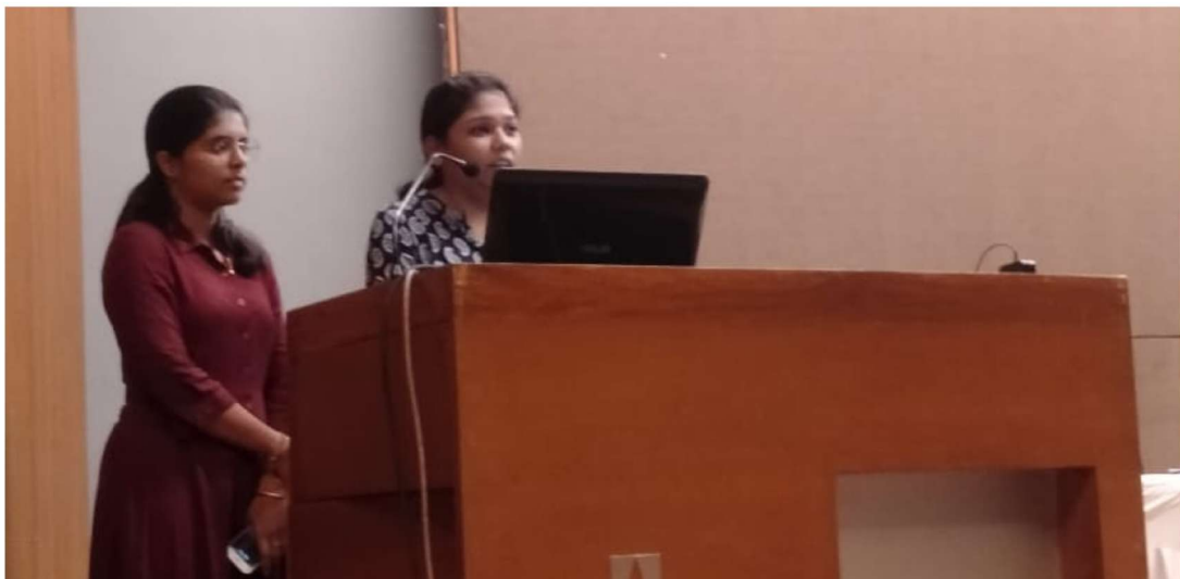
UMC team briefing district officers on SLRM technologies