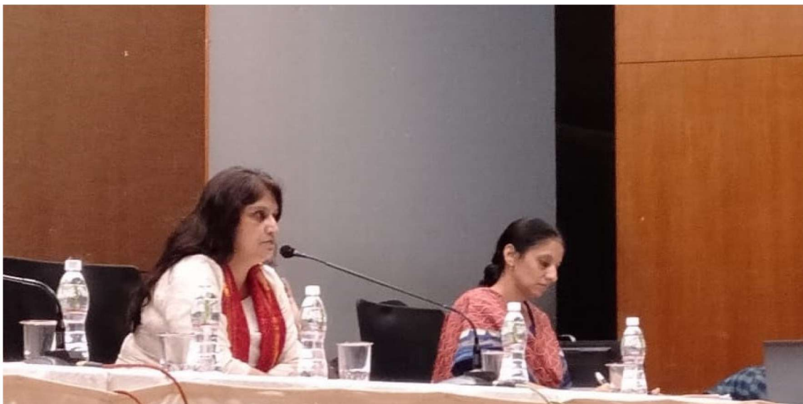
Mona Kandhar, IAS, Commissioner and Secretary, Rural Development Department, Gujarat spearheading the meeting for Tripartite Agreements

UMC has been providing technical assistance for implementation of solid and liquid waste management plans in select gram panchayats of Gujarat with support of UNICEF. Earlier, we had prepared model SLRM plans for 5 villages in Gujarat. SLRM planning and implementation will now be scaled to 1100 Gram Panchayats in Gujarat having population more than 5000 in phase wise manner (phase I - 250 villages, phase II - 350 villages and phase III - 500 villages).