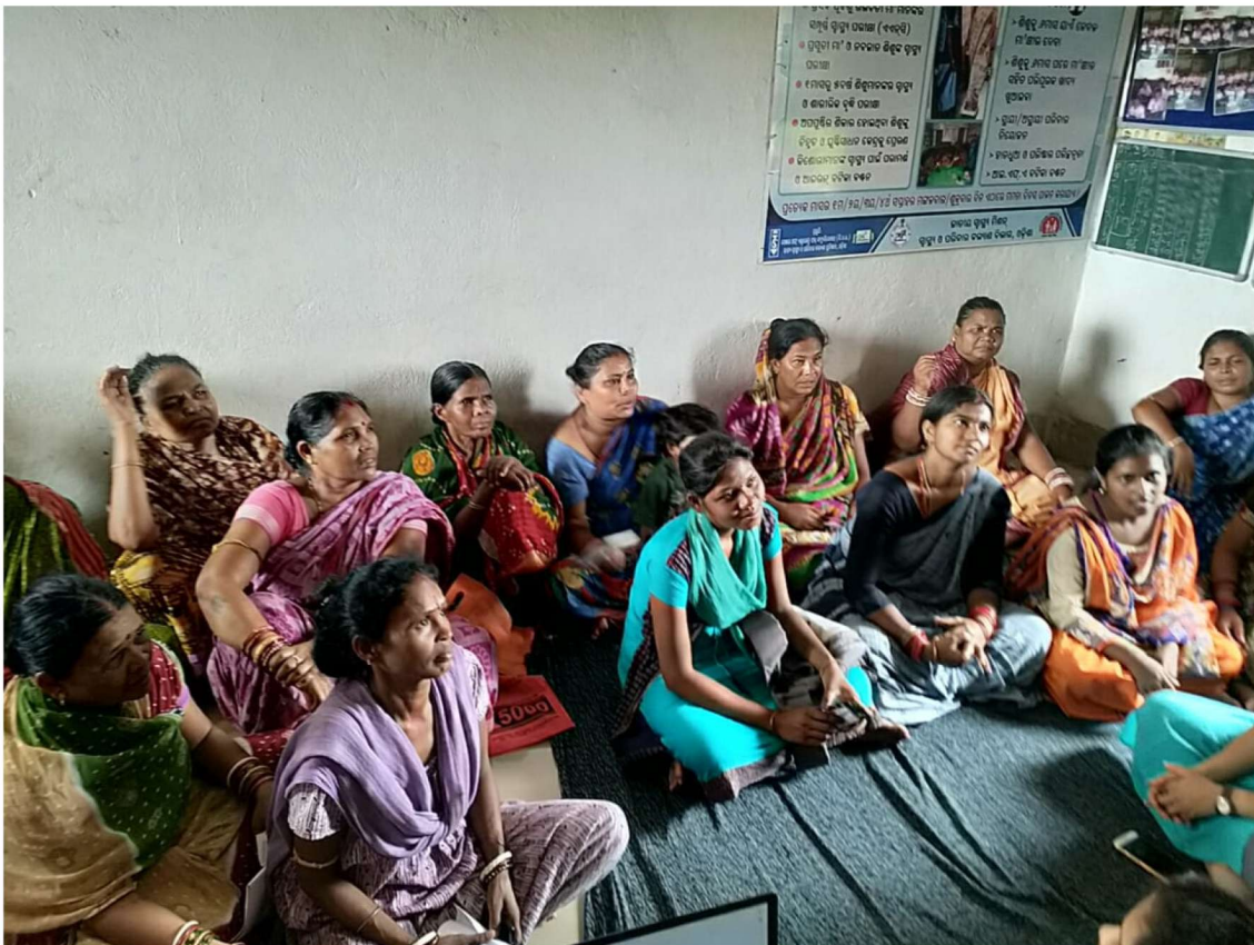
Active community engagement for fastracking IHHL provision, further motivating members of the community

Under MISAAL in partnership with USAID, we are supporting ULBs in the three states namely Gujarat, Rajasthan and Odisha to achieve and sustain ODF by focusing on community engagement and behaviour change. MISAAL envisions sanitation as an economy that can harness livelihoods opportunities aiming to create an enabling ecosystem for sustaining ODF.