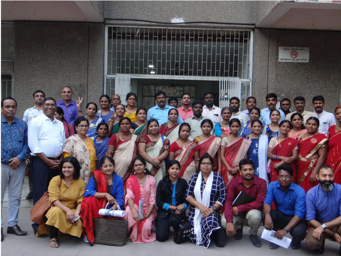
The two-day study tour ended on a positive note with officials encouraged to replicate best practices

UMC is implementing convergence between DAY-NULM & SBM within the cities of Dhenkanal, Bhubaneswar and Paradip in Odisha and Warangal in Telangana which is funded by Bill and Melinda Gates Foundation.