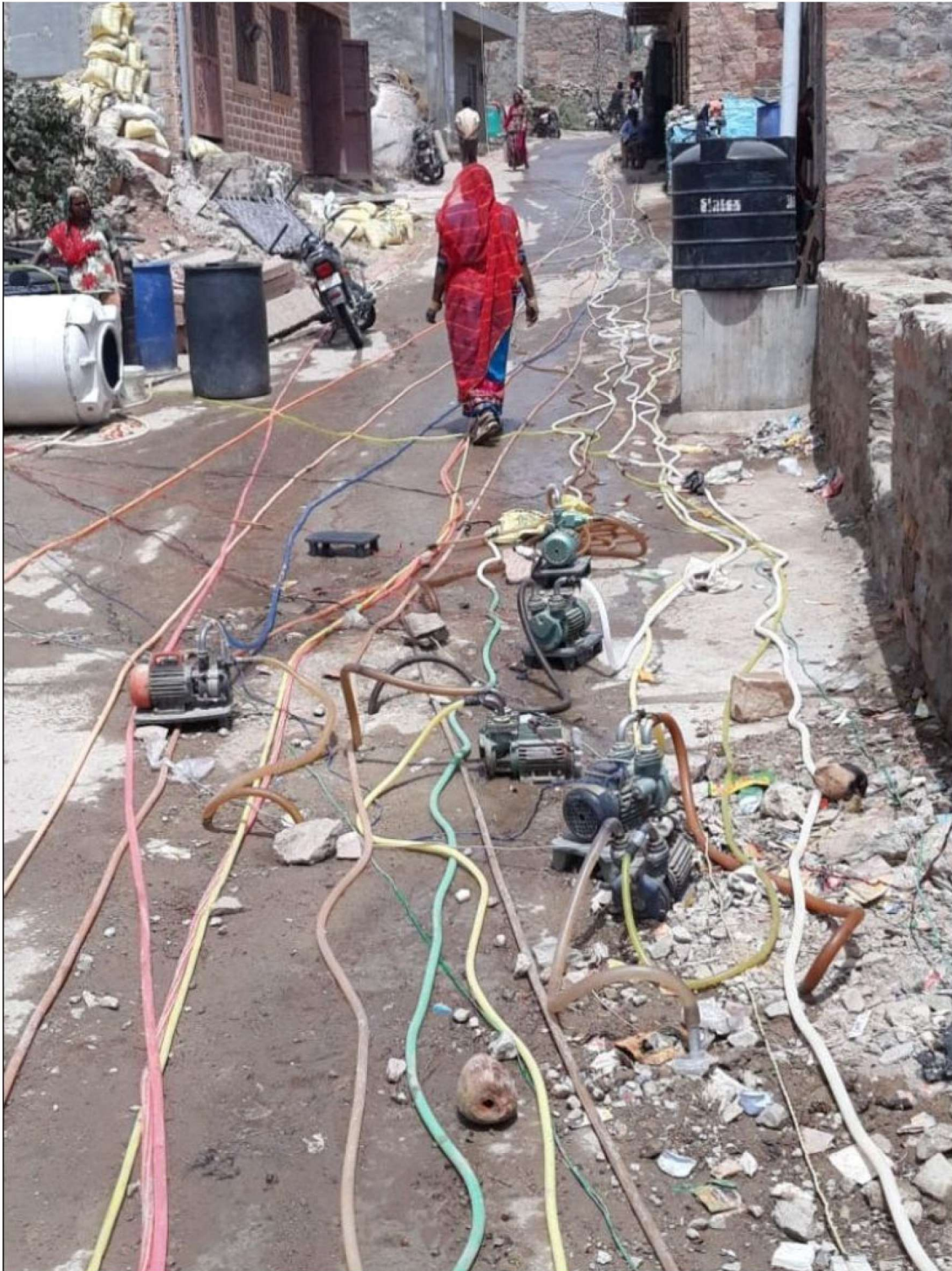
Slums in Jodhpur are located on ridges, due to this access to water is a problem and hence maintenance of PT/CTs is one among many challenges in sustaining ODF+