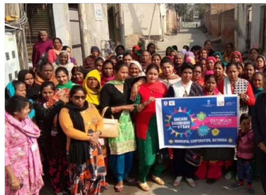
Workers took out rallies and celebrated opportunities during Shahr Samridhi Utsav