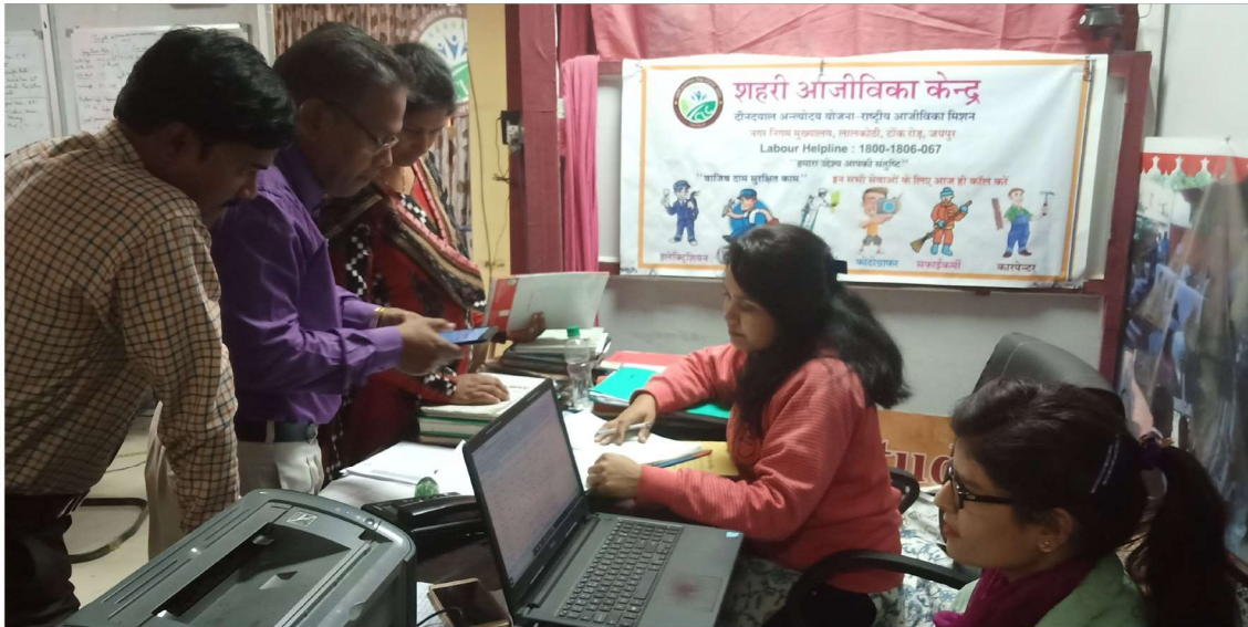
City Livelihood Center in Jaipur visited by NULM team from Dhenkanal, Odisha

The online presence ensures availability of services for the consumer at cheaper rates from people with knowledge based on contextual challenges.