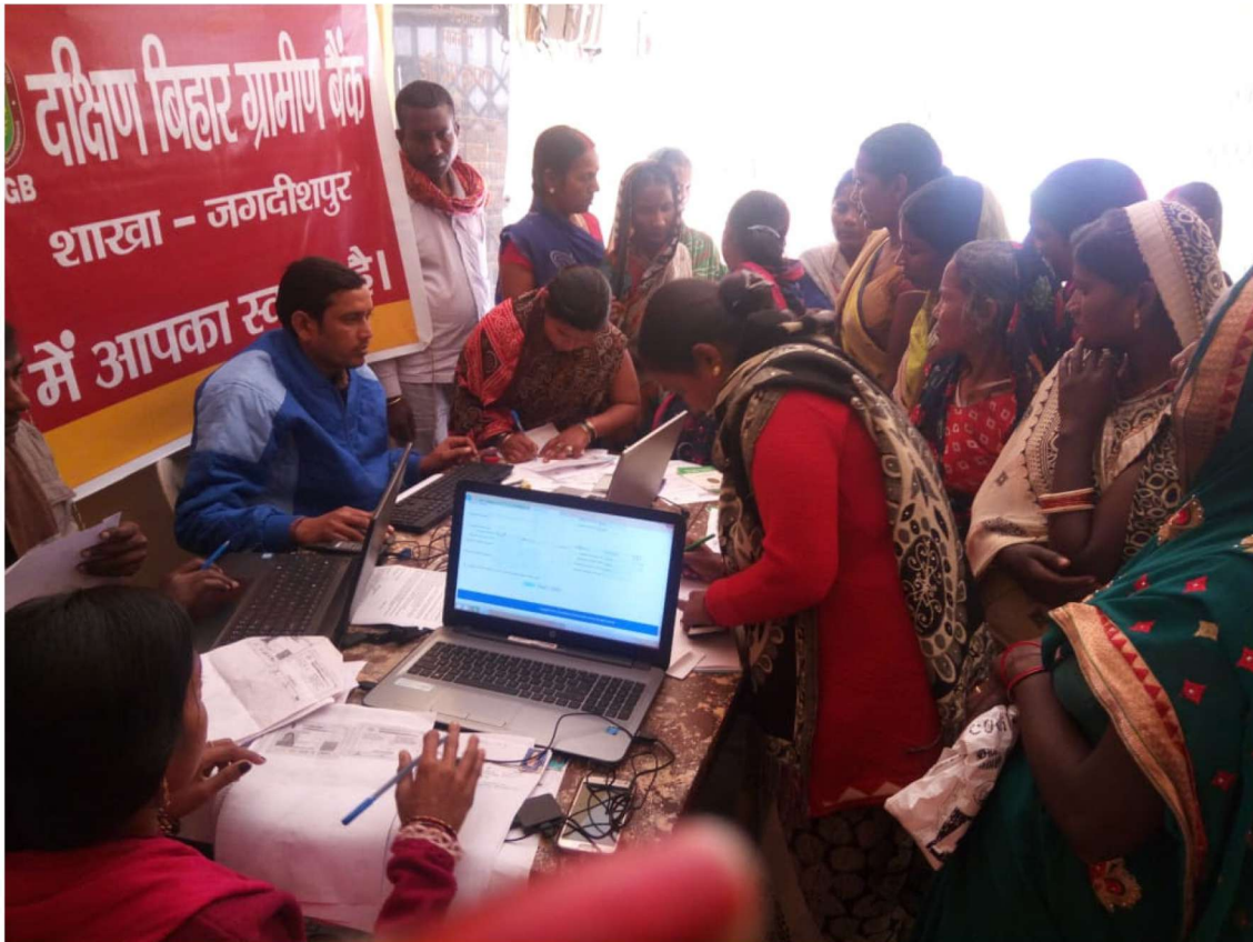
Women workers registering themselves during Shahr Samridhi Utsav in Bihar