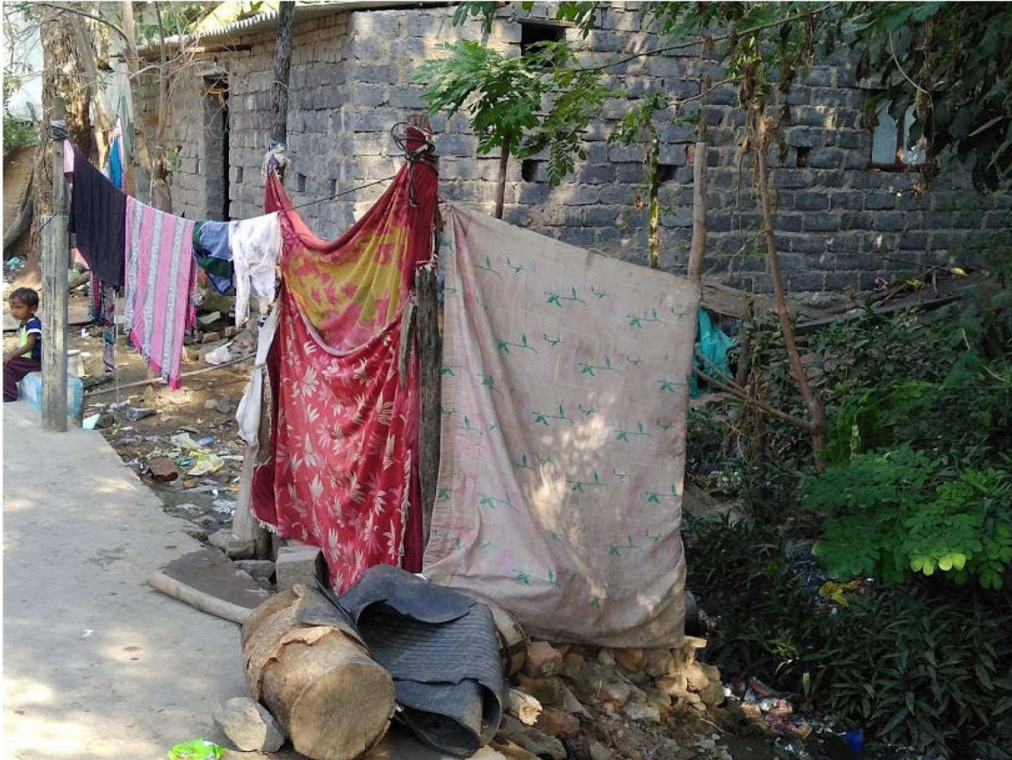
A temporary makeshift toilet in Sambalpur