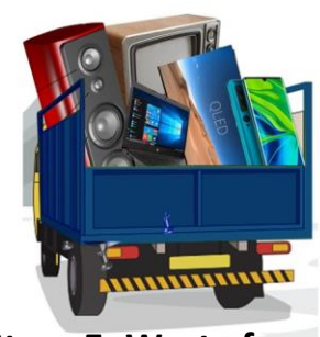
Store E- Waste for selling to empanelled buyers