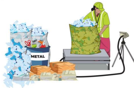
Weigh sorted waste