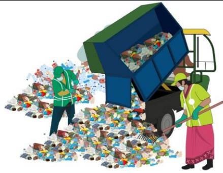
Unload Dry waste