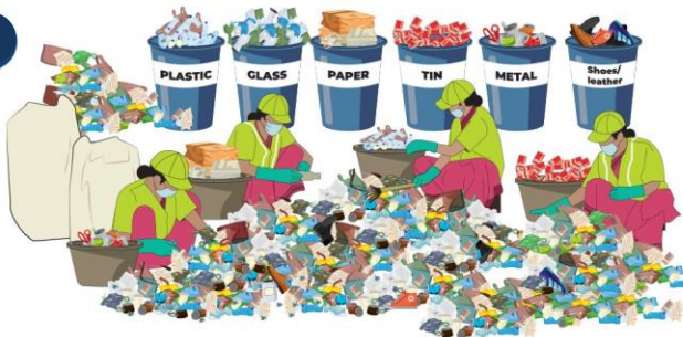
Sort Dry waste into various categories