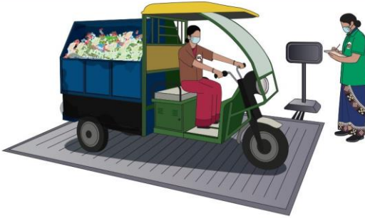
Weigh and record Dry waste received