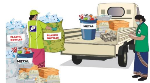
Sell recyclable waste to recyclers/ kabaadiwala