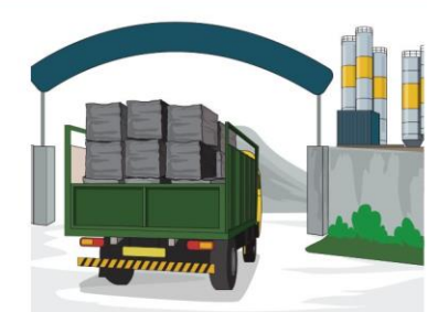
Store non-recyclable waste to empanelled buyers