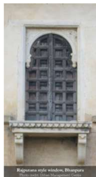
Rajputana style window, Bhanpura

There have been efforts to prepare list of heritage structures which are covered by neither by ASI nor by DSA, and get the urban local bodies to notify them. These efforts have been made by INTACH for cities of Bhopal, Chanderi, Maheswari, Gwalior and Ujjain. However in none of the cases, cities have notified them despite Bhopal having established a heritage cell. A detailed list of heritage buildings has been provided in Annexure 11.